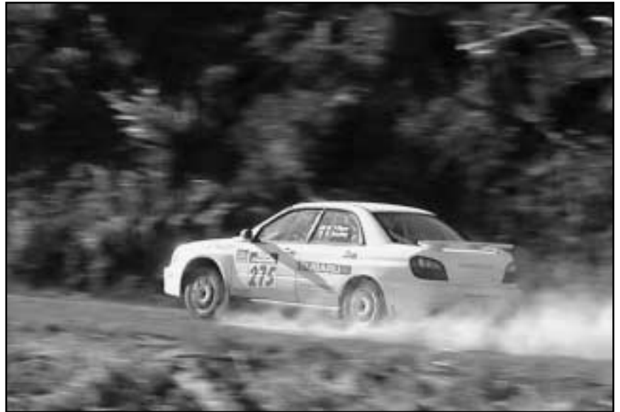
Nat T Stowe in car #275

Next event is the Oregon Trail Pro Rally held