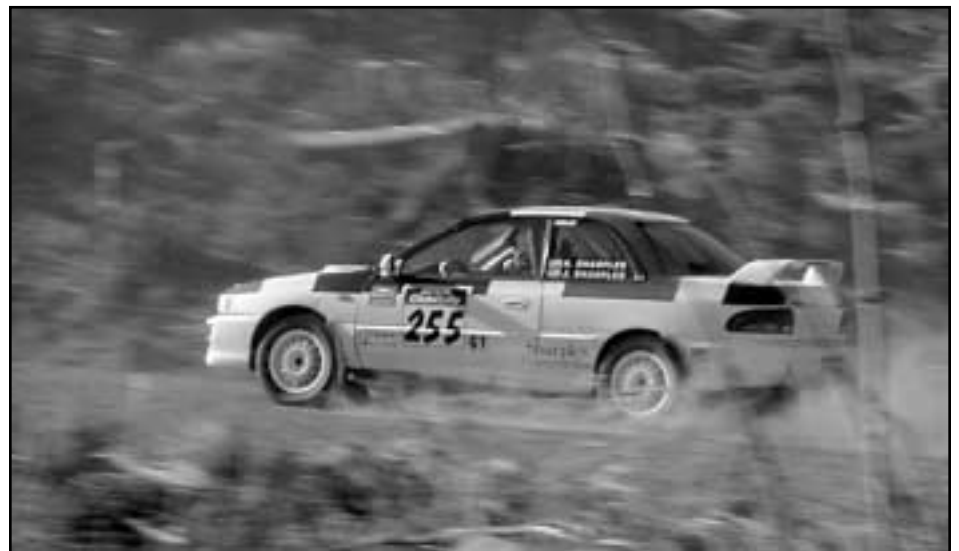
Andy Sharples in car #255.